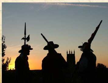
Worcester Re-enactors on Fort Royal Hill.