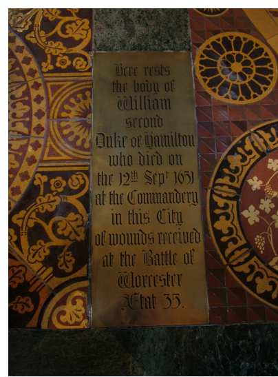
The Duke of Hamilton's Tomb, Worcester Cathedral, UK