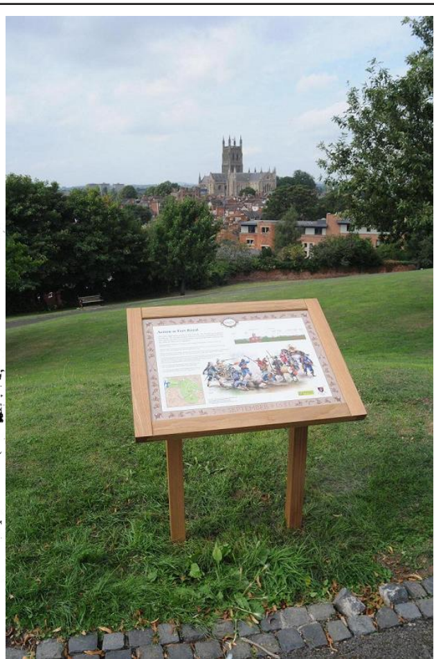
One of the new Fort Royal information panels

The Society has already started working with our friends from the Battlefield Trust in relation to developing a small picnic spot at the confluence of the rivers Severn and Teme, where the Parliamentary army built the famous Bridge of Boats. Now known as Cromwell's Crossing, it is hoped that an interpretation panel, seat and proper access will be possible in time.