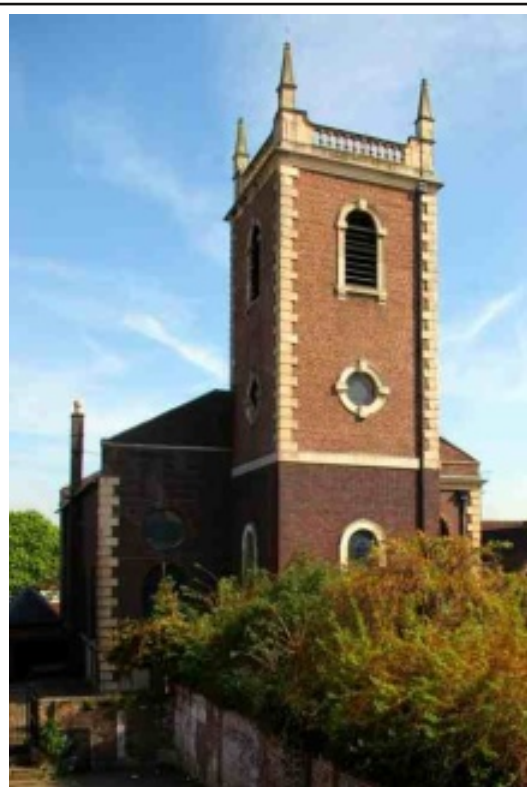
Old St Martin's Church