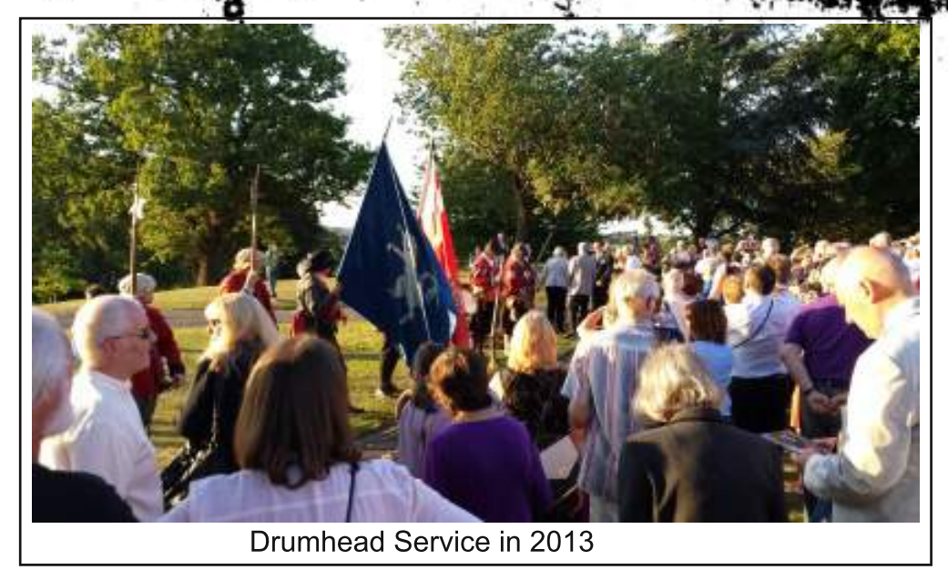
ANNUAL DRUMHEAD SERVICE at FORT ROYAL WEDNESDAY 3rd SEPTEMBER Commandery from 6pm Fort Royal from 7pm Full details to follow

BATTLE OF WORCESTER DINNER at THE GRAEME HICK PAVILION, WORCESTERSHIRE COUNTY CRICKET GROUND, NEW ROAD FRIDAY 3rd SEPTEMBER