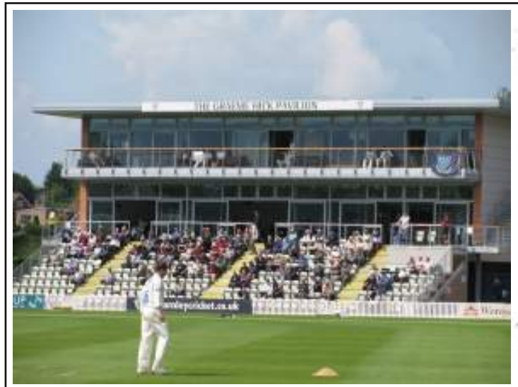
The Graeme Hick Pavilion (the dinner is inside)

To reserve tickets please contact Vaughan Wiltshere wiltshireford@btconnect.com