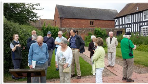
Our merry band.