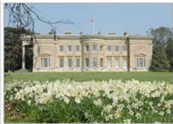
The stunning grounds of Spetchley Park Gardens.